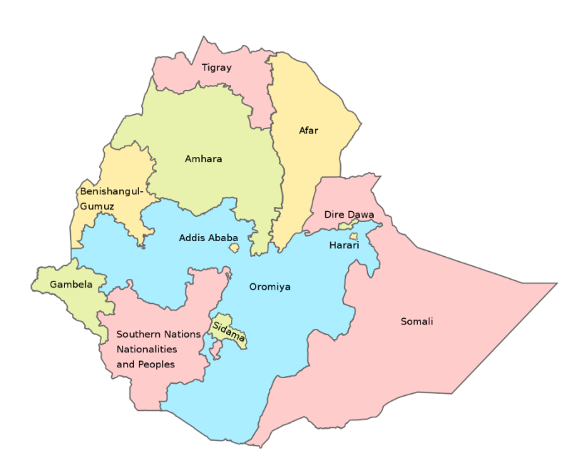
Ethiopia is divided into eight ethno-linguistically based regional states

Ethiopia hosted a much-delayed general election on 21 June 2021 the midst not only of Covid-19, but an ongoing civil war in Tigray, instability in the Oromiya and Amhara regions and continuing frictions with its neighbours, notably Sudan. The event reminds that while elections can be an important component to ending conflict, they are only a means to an end and cannot bring peace and prosperity on their own.