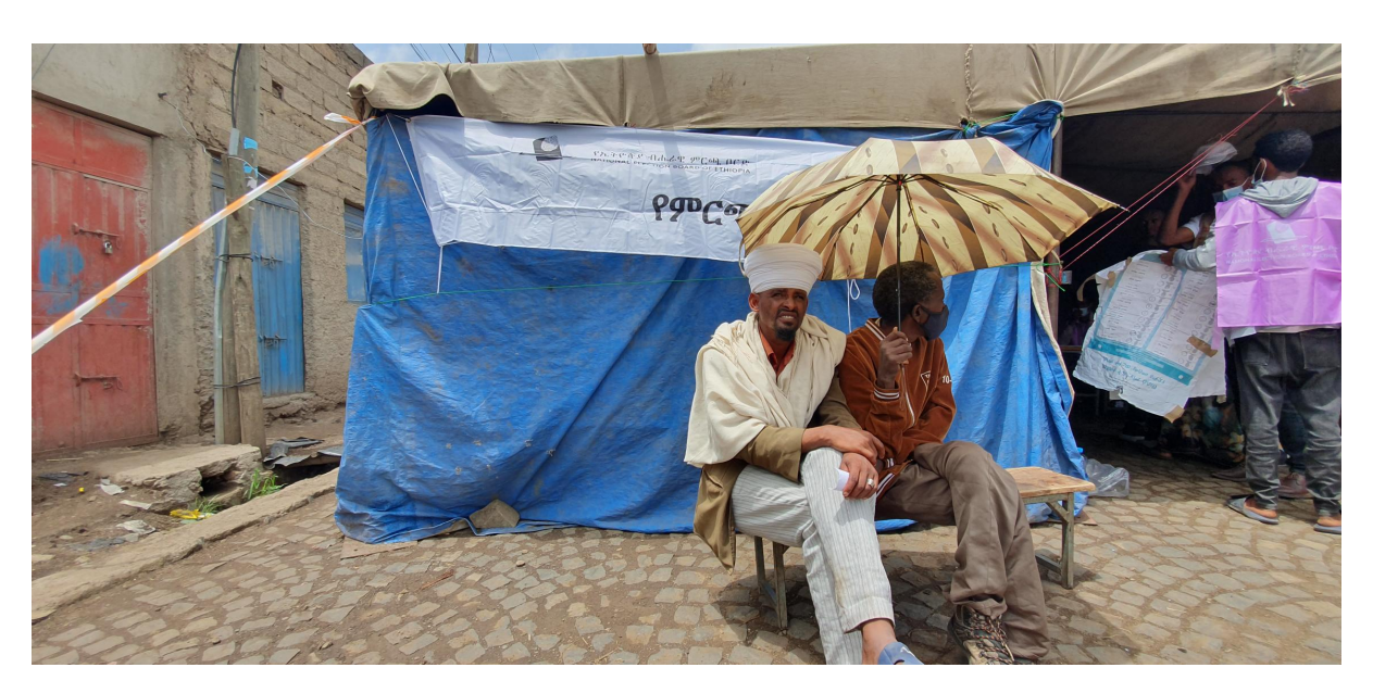
The election turnout was anticipated to be over two-thirds of those registered, though concerns exist about the extent of the democratic space.

Political space was limited. The Ethiopian Human Rights Commission reported 9,000 people had been detained in 2020, for example, following outbreaks of violence after the killing of the popular Oromo singer Hachalu Hundessa which left hundreds dead, while on election day itself there were reports of hindered access to ballots and acts of violence, causing delays in the voting process.