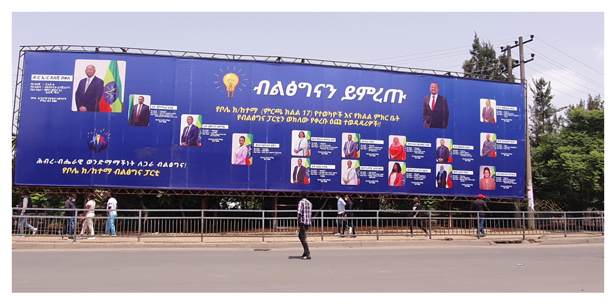
Prime Minister Abiy Ahmed's opponents say the democratic space was too limited to claim the election as free and fair, but was it a forward step in the direction of democracy?

Ethiopian military forces are clearly evident in Mikelle's markets and streets, on foot patrols and cruising around in their crudely camouflaged 'technicals', usually with a Ray Bannned soldier 'riding' behind a loaded machine-gun.