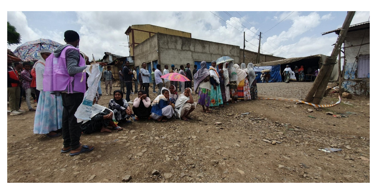
37 million voters registered for the June 21 election, with 9,000 candidates and 49,000 polling stations across most of Africa's second most populous country, a logistical feat.

Touted as the first free and fair election in Ethiopia by both government and some opposition figures, the organisation of the June 2021 election was imperfect. It could not be held countrywide given a combination of security concerns and registration problems. The contest in more than a hundred of the total of 547 parliamentary seats was postponed, including 38 in Tigray, while, in a further 104, only the ruling Prosperity Party put up a candidate.