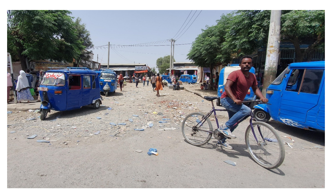
Underlying the TPLF rebellion was a fundamental refusal to accept the loss of power in 2018 with the installation of the Abiy government, and still more basically a deluded assessment of their ability to maintain the same level of control over the national government that they had enjoyed until then.

The government in Addis Ababa then launched a military operation into Tigray in November 2020 aimed at decapitating the leadership of the TPLF. The co-ordination of Eritrean and Ethiopian forces along with Amharic irregulars and drones from the United Arab Emirates suggests that the plans for the invasion had been laid some time before.