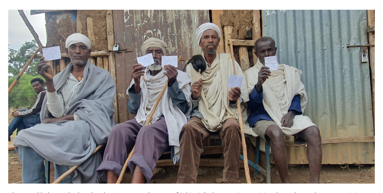
Above and below: Whether the election proves the start of Ethiopia's democratic transition depends on what actions Prime Minister takes now. Voters proudly display their registration cards at Barhie Ginbe 01 voting station, 20kms from Ethiopia's second-largest city of Gondar.

The key factor in the election is not simply how much Abiy would win by, but whether it provides the government with some means of recruiting and identifying groups and individuals, especially in Oromiya and Amhara, which it is prepared to recognise as having some basis of support and with which it will be able to establish a working relationship.