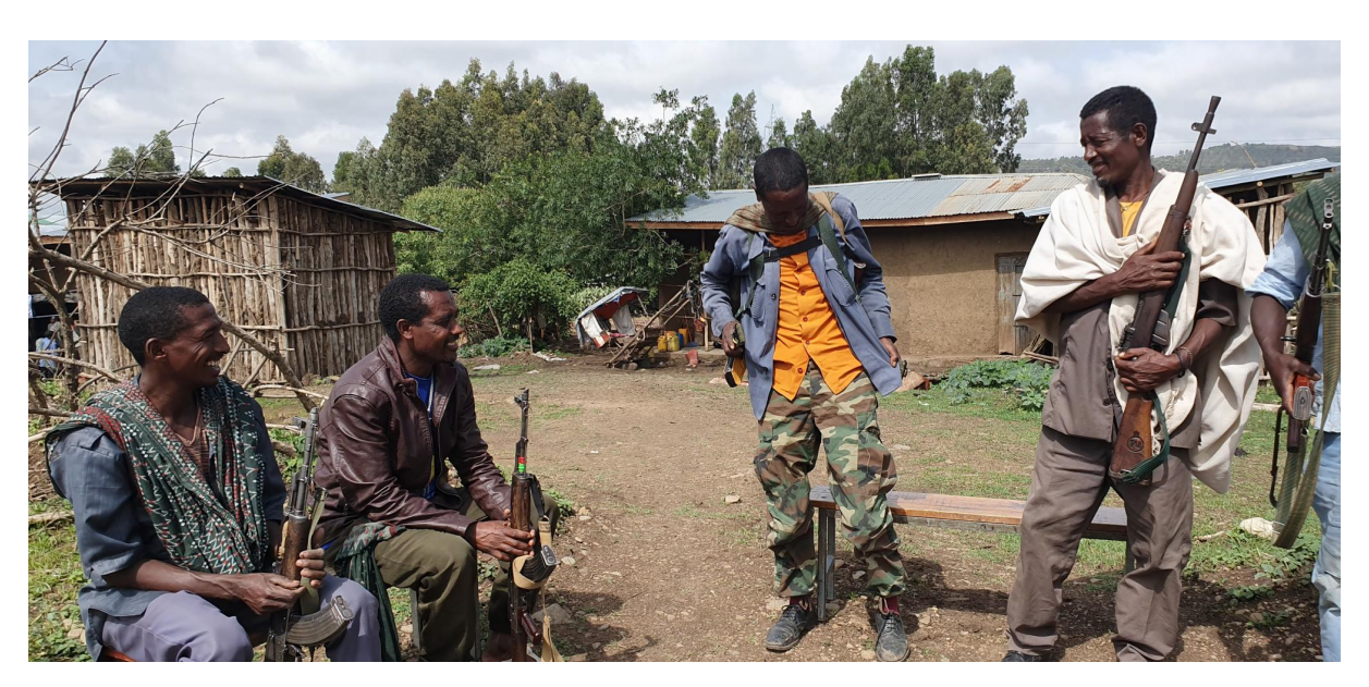
There was a discreet presence of police and militia around most Amhara voting stations, including this one in the Gondar region.

The problem for Abiy is, however, that the Eritreans are needed for him to maintain a military grip over the estimated 20,000-strong (and growing) TDF. With just 40,000 Ethiopian troops available, and perhaps 20,000 Amharic militia, the 30,000 Eritrean soldiers helped him get close to the preferred counter-insurgency ratio of 10:1 (or 200,000 government troops). Even at alternative benchmark ratio of 20 troops/1,000 population, 140,000 government forces are required.