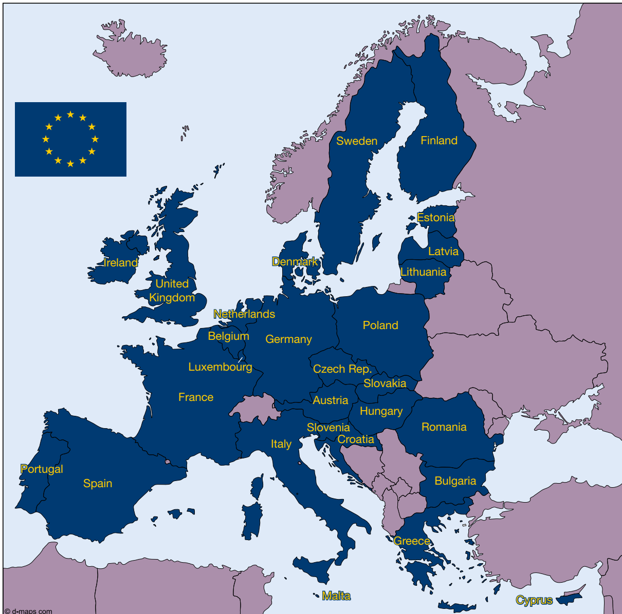
Map 1: EU Member States

If no post-Brexit agreement has been reached two years after Article 50 has been invoked, all EU rules, rights and obligations for the UK cease to exist. Negotiating the UK's exit within two years is going to be a herculean task.