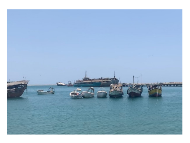
Part of the small fishing fleet at anchor in Berbera. The vessels, which are mostly between five and 12 meters long, are too small to be commercially successful.

a flock.'13 This is, in fact, the case at present, as fishing is conducted on a small scale and the sale of fish is limited to the coastal area due to the lack of a reliable cold-chain for the transport of the fish to the interior. It is notable that the capital city of Hargeisa with its large population, has no fish market despite its relatively close proximity to the coastline. Fish ought to be a readily available cheaper protein option throughout Somaliland and it ought to have an export market given the short distance to big fish-consuming markets in the Mediterranean which are readily accessible via the Red Sea and the Suez Canal.