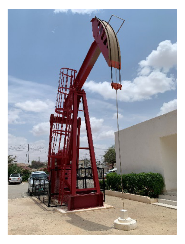
An oil derrick on the ground of the ministry of energy and minerals in Hargeisa. These may soon become a regular feature of the desert landscape.

The optimism over the possibility of oil in Somaliland derives from the fact that it shares the same geology as the oil fields on the Arabian Peninsula. 'The oil is there, it is just a matter of when we get it,' says Egal.