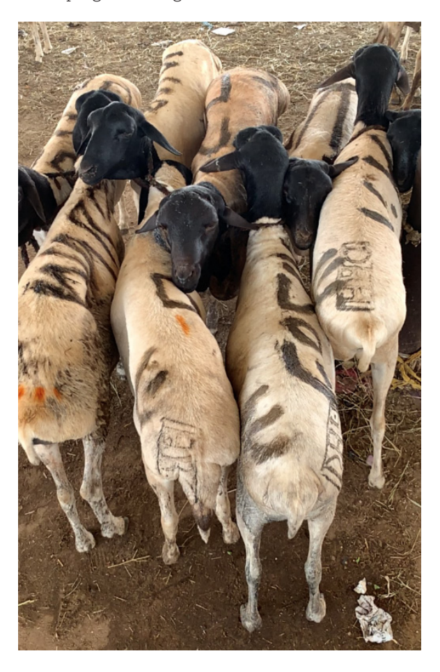
Blackhead Persian sheep await their fate at the Hargeisa livestock market. The export of these sheep to Saudi Arabia is the country's major earner of foreign exchange.

Although Somaliland struggles to export its livestock because of its unrecognised status, this unique sheep is an exception. During the annual Muslim pilgrimage to Saudi Arabia, more than a million sheep and goats are exported for slaughter in keeping with religious tradition.