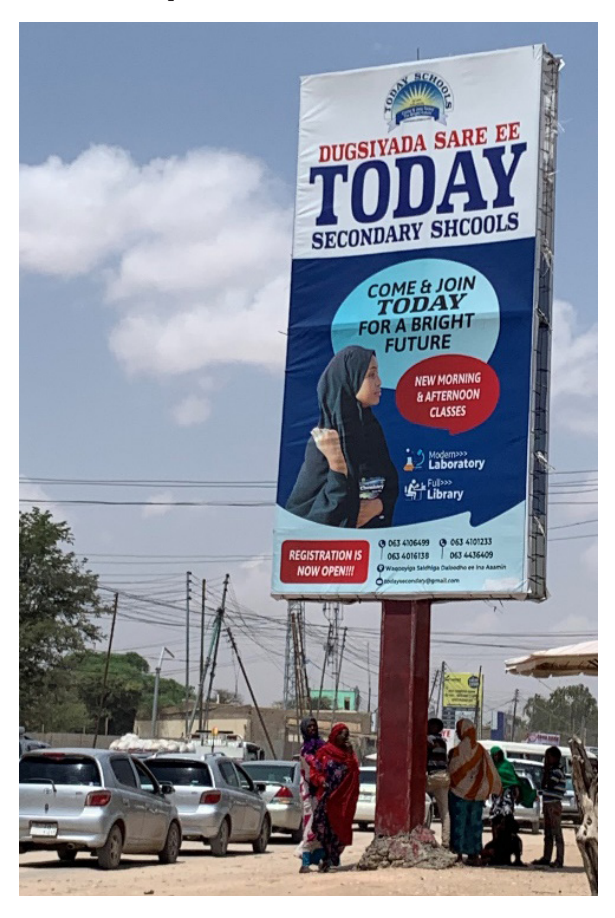
A billboard advertising a private school. Most education is run by private institutions that produce poor results with literacy at just 18 per cent.

is straining. Infrastructure is poor. The unemployment rate among those under 30, who comprise 70 per cent of the population, is 75 per cent.<sup>1</sup> The chewing of khat is a widespread social blight among more than half the adult population, an effective tax on productivity and foreign exchange, soaking up as much as US$700 million in annual imports.<sup>2</sup>