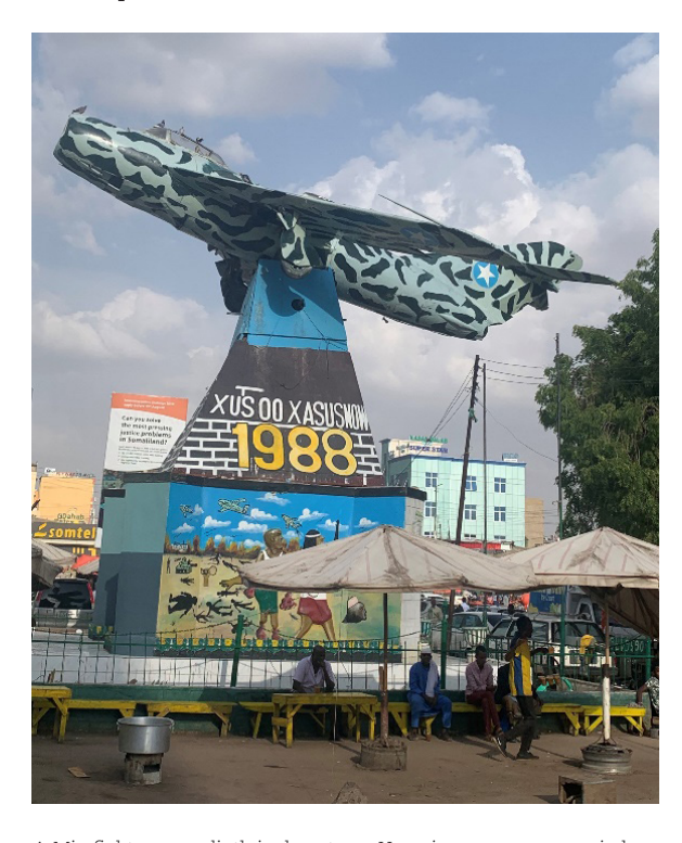
A Mig fighter on a plinth in downtown Hargeisa serves as a reminder of the bloody civil war. But these days it is the place where the growing army of unemployed youth hang out to drink Somali tea.

The restive east notwithstanding, a great deal has been achieved by the hitherto unrecognised Republic of Somaliland since its re-proclamation of independence in 1991.