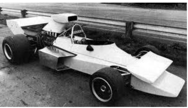
The innovative if unsuccessful 1974 Amon F1 car.

between the engine and driver, all of which were later copied by other teams and became F1 de rigeur .