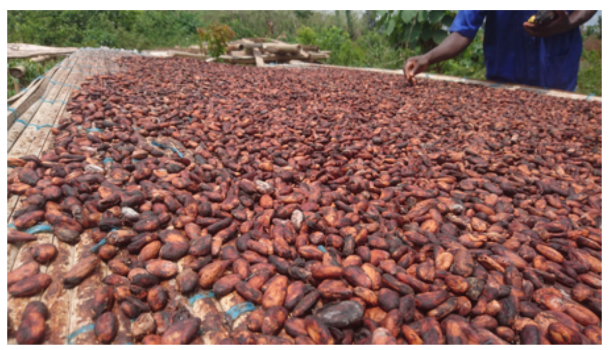
Cocoa beans laid out in the sun to dry.