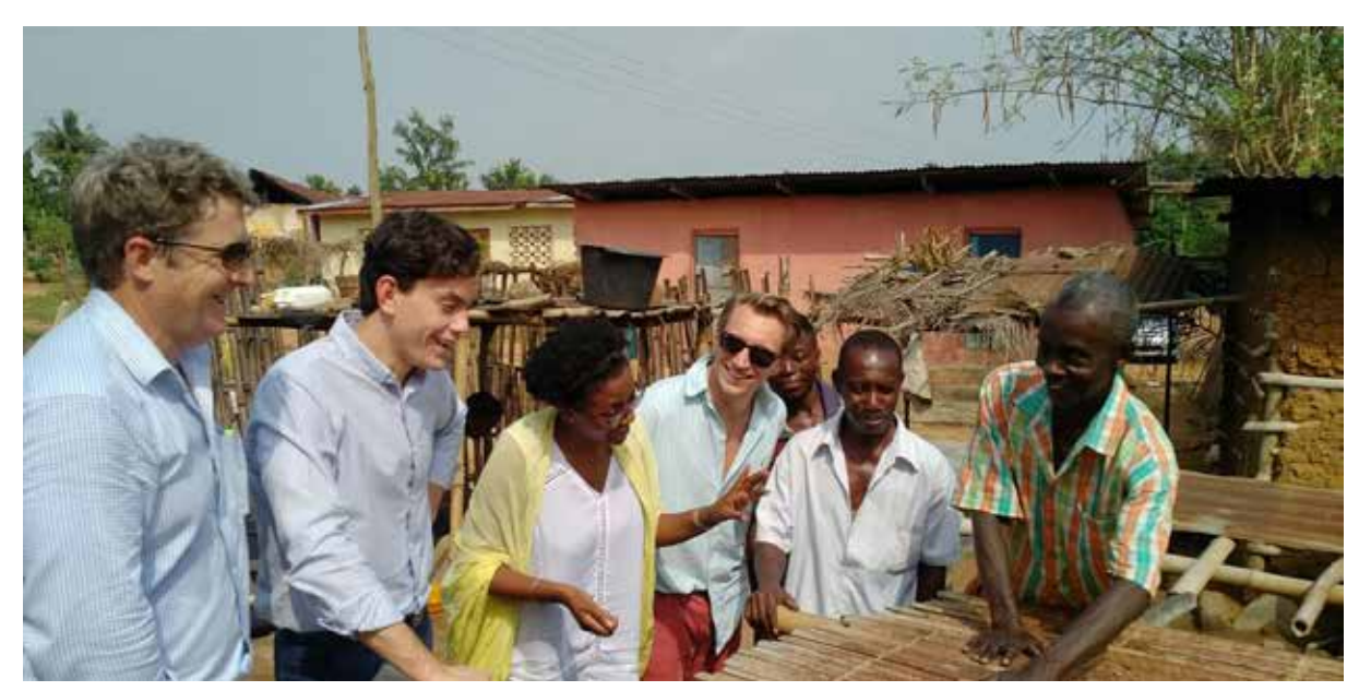
A team of researchers from the Brenthurst Foundation speaks to a farmer in Nsawum, near Accra in Ghana.

The story of 57 Chocolates, an artisanal chocolate manufacturer based in Accra, reveals the challenges facing the local industry. 57 Chocolates was started in 2014 by two sisters who had recently returned from their studies in the United States. With their own capital, they visited chocolatiers in Europe to learn the trade and purchased the basic equipment for a chocolate workshop. Their goal was 'to prove that we can make quality