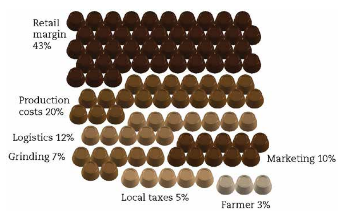
Figure 1: Percentage share of value in the chocolate supply chain

Against this troubling backdrop, what can Ghana do to reap the full benefit of this unique resource? What steps can the government take to improve farmer livelihoods, protect against price instability, build local manufacturing and create dignified jobs? This discussion paper argues that a series of bold, yet careful, interventions in the cocoa sector could achieve these outcomes, and provide a significant boost to the national economy. Key to this effort is a clear diagnosis of the impediments to growth and a creative set of solutions to tackle them. To that end, the first section of this paper describes the effect of recent reforms on the Ivoirian cocoa sector, while a second section turns to the situation in Ghana. A third and final section charts a path forward, taking into account what Ghana might learn from the experience of its neighbour.