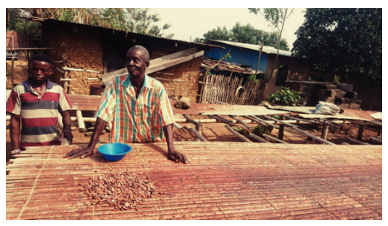
A farmer and his grandson stand beside the cocoa bean drying rack near their home.

goods at home', and their first batch was produced in 2016. While the business has slowly expanded, it has experienced significant challenges. One of the founders describes the hurdles they have faced, including the difficulty of registering a business and the cost and instability of power (crucial for such a hot environment, where the AC must run continuously). Most importantly, the highly-centralised system makes it nearly impossible for local producers to source cocoa supplies, as almost all the country's harvest is channeled to exports or larger local companies and it is impossible to purchase cocoa directly from farmers.