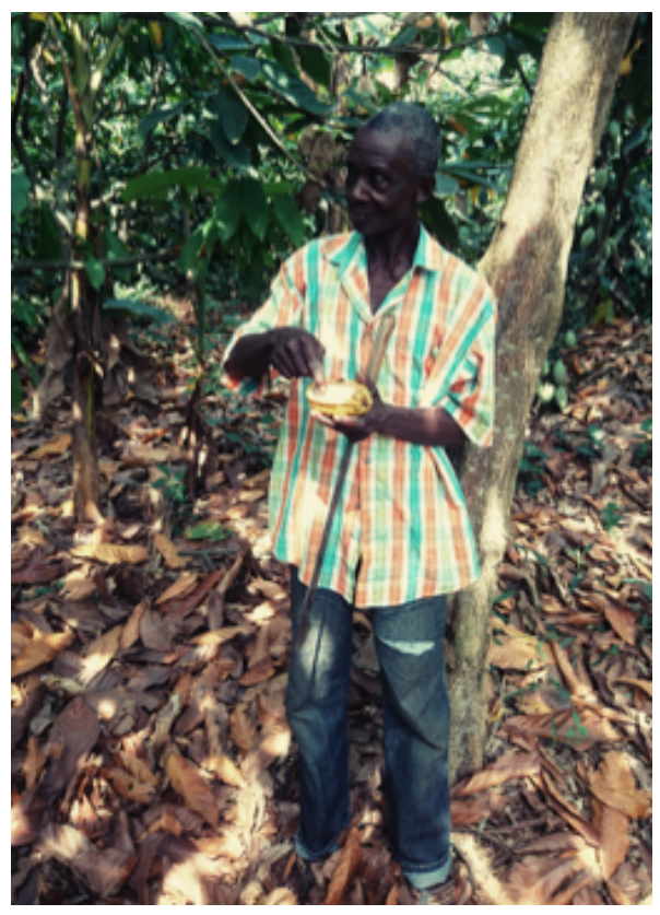
A farmer demonstrates the harvesting and fermentation process in Nsawum, near Accra in Ghana.