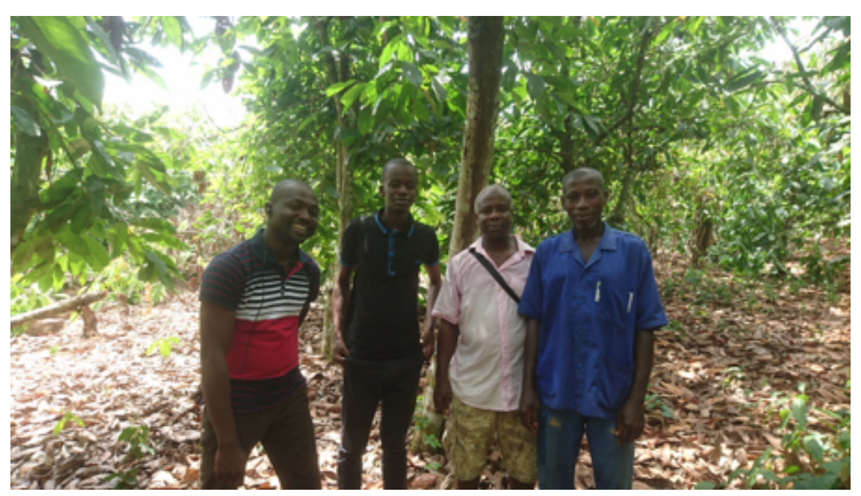
Cocoa farmers in a village near the town of Afféry in Côte d'Ivoire.