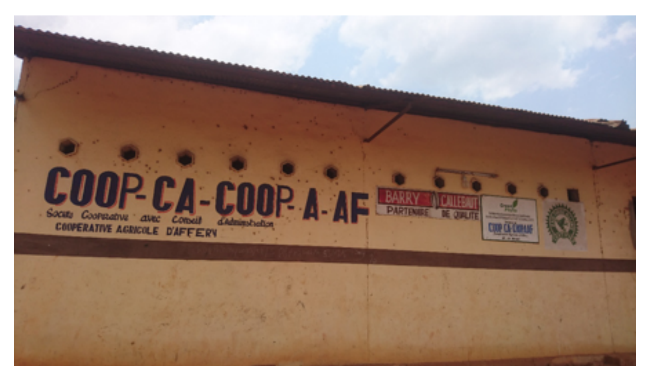
The office of the COOPEC cooperative, in the town of Afféry in Côte d'Ivoire.

The first option is clearly suboptimal, and has led to annually decreasing yields while suffocating the local private sector. The second option, however, is neither politically nor practically feasible in the short term. Farmers and farmer organisations are opposed to liberalisation because of its perceived failure in Côte d'Ivoire, and because they benefit from the fixed minimum price. COCOBOD is equally opposed to such a reform, because it would lose control of the sector. Reform of this type would be politically costly as a result. It is also likely that farmers in Ghana are not ready for liberalisation, as they operate at a small scale and in a largely uncoordinated manner and would find it difficult to negotiate effectively with powerful traders. Reforms implemented too quickly or too early could lead to failure, and render any future reform efforts politically impossible.