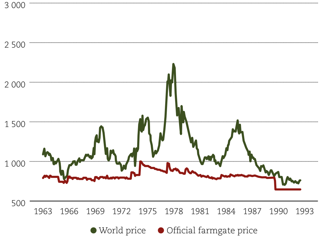
Figure 2: World and farmgate prices for cocoa in Côte d'Ivoire, 1963 to 1993

The crisis which resulted from the commodity price crash triggered a debate about structural reform of the sector. In the late 1990s, under pressure from the IMF and the World Bank, the government decided to liberalise the market. The Caisstab was dissolved and replaced by numerous private bodies which released daily 'indicative prices' based on the market price in New York and London. Traders (or 'traiteurs') bought cocoa directly from farmers, and sold it on to exporters at a margin. Farmers and cooperatives were free to negotiate the price of their goods on an ongoing basis, in the absence of an enforced minimum.