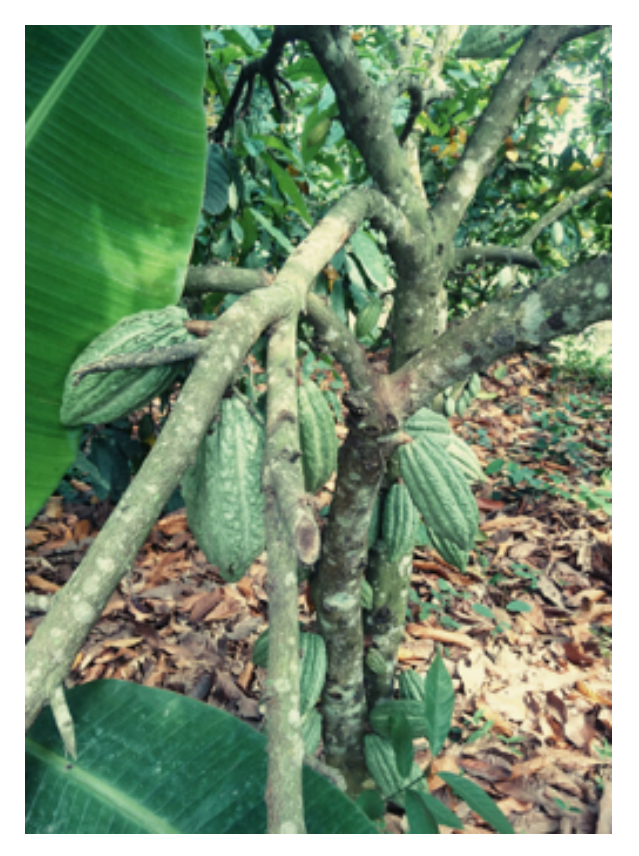
Cocoa pods ripening before the main harvest.