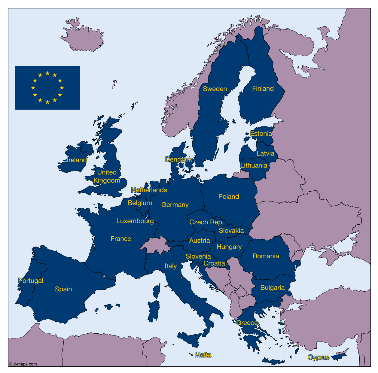
Map 1: EU Member States

If no post-Brexit agreement has been reached two years after Article 50 has been invoked, all EU rules, rights and obligations for the UK cease to exist. Negotiating the UK's exit within two years is going to be a herculean task.