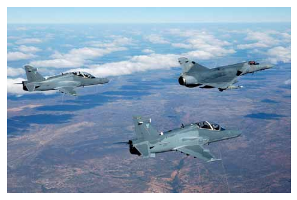
The Old and the New. SAAF Cheetah and Hawks in flight.3

How would this be achieved? The SANDF, comprising the old South African Defence Force (SADF) and the Bantustan armies of Transkei, Venda, Ciskei and Bophuthatswana along with the African National Congress' and Pan-Africanist Congress' military wings, would be downsized (from 105 000 uniformed personnel to 75 000): a small regular force (core force) with a large reserve force for in extremis mobilisation. The army would also withdraw from internal operations (border control and co-operation with the police); helping to release forces to the envisaged but relatively small contribution to African peace missions.