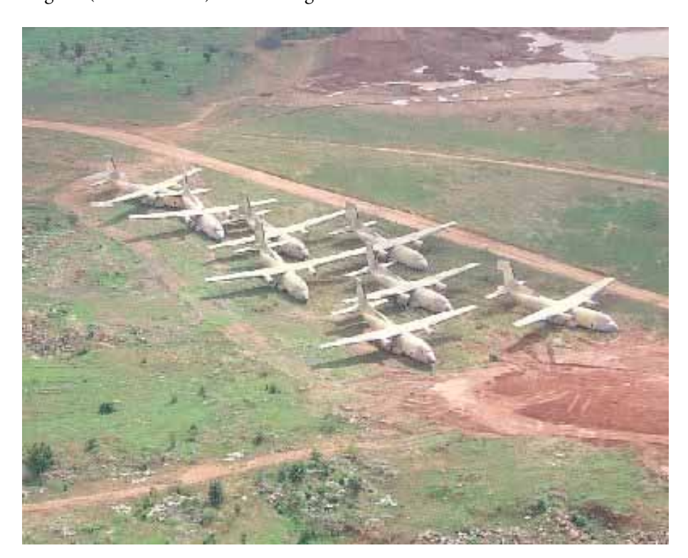
The Remnants of the SAAF's Transall Fleet, Waterfkloof AFB, 2009.<sup>16</sup>

game. But this is still not a choice, at least not now. As one RAF officer put it in discussion in Kandahar, '[to] do Afghanistan, we need ten more C-17s now – and the A400M later.' This requirement has been recognised, too, by South Africa in its original (now cancelled) order for eight A400Ms.