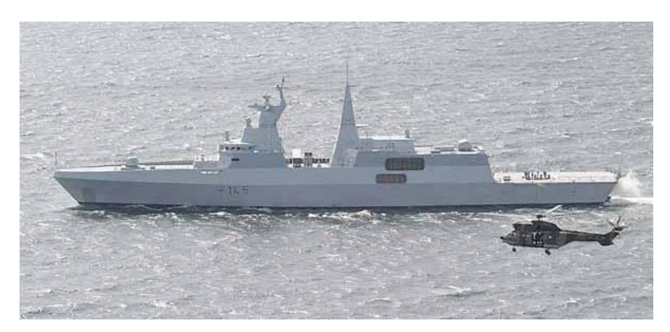
SAN Meko A-200 Valour-class<sup>25</sup> frigate.<sup>26</sup>

Under Project Biro three offshore patrol vessels (OPV) and six (60m) inshore patrol vessels (IPV) are to be acquired to replace the remaining strike craft and mine hunters. The six IPVs consist of three more than approved in 2007 and will likely carry the four Project Mapantsula mine countermeasure (MCM) systems required in terms of the 2030 blueprint, as and when required. The replacement hydro-graphic survey vessel ( Project Hotel ) may be included if the final specification is close enough to that of the OPV to allow it.<sup>24</sup>